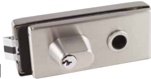
PF251 ENTRY (KIK CYLINDER)