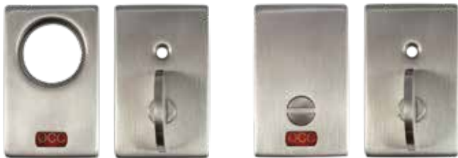
DM00X-PPRVIQ-ECYL Keyed Occupancy Indicator Kit (Cylinder not shown) For function 45, 56 or 84