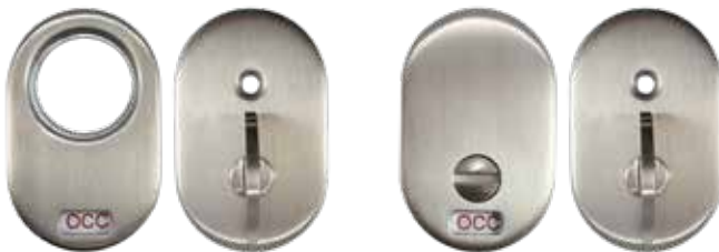
DM00X-PPRVI-ECYL Keyed Occupancy Indicator Kit (Cylinder not shown) For function 45, 56 or 84