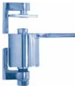
7412 BRASS SURFACE BALL BEARING PIVOT