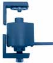
7122 MORTISE PIVOT