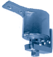
7112 SURFACE PIVOT