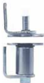
7512 STANDARD STEEL PIVOT